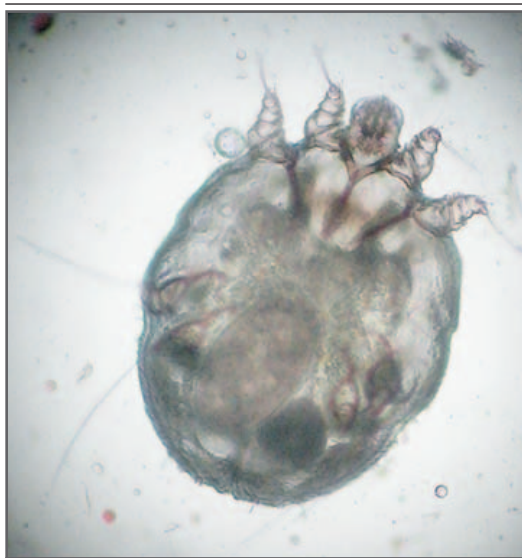
Figure 1. Adult Gravid Scabies Mite.

Definitive diagnosis relies on the identification of mites, eggs, eggshell fragments, or mite pellets. Multiple superficial skin samples should be obtained from characteristic lesions — specifically, burrows or papules and vesicles in the site of bur-