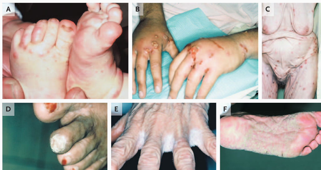
Figure 3. Special Forms of Scabies.

Panel A shows scabies in an infant. Localization on the sole is not atypical in this form of scabies, nor is involvement of the face, scalp, and palms. Panel B shows a patient with scabies superinfection presenting as impetigo. In such patients, the risk of glomerulonephritis associated with nephritogenic strains of streptococcus is of concern in developing countries. Panel C shows atypical papular scabies in a very old woman, who also had similar lesions on her back. Frequently, scabies goes unrecognized in such patients because itching is attributed to senile pruritus. Panel D shows localized crusted scabies in a young woman who was being treated with an immunosuppression regimen after renal transplantation. She presented because of a symptomless hyperkeratotic toenail; many mites were found in skin scrapings. Panels E and F show generalized crusted scabies in the finger webs and on the sole of the foot, respectively. This form of scabies is highly contagious, leading to outbreaks in institutions, including hospitals and nursing homes.