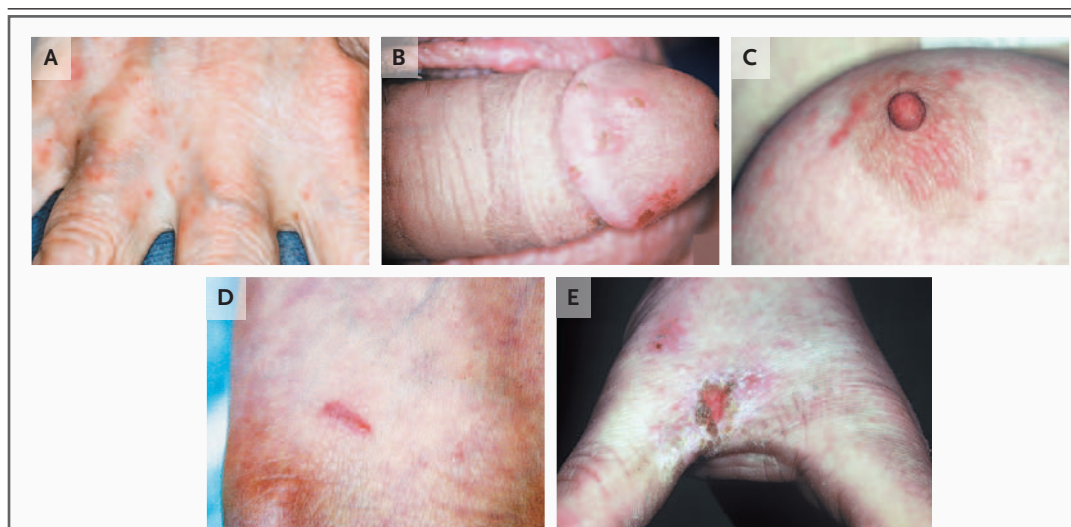
Figure 2. Classic Scabies.

Typical scabies in the finger webs evoke the diagnosis (Panel A). Nail involvement is uncommon in classic scabies but common in crusted scabies. Panel B shows involvement of the male genitalia in a patient with excoriated and papular scabies. The genitalia should be examined in all instances of suspected scabies infestation, especially when the patient reports itching. Panel C shows the breast of a woman with papular scabies lesions on the nipple and areolar area — a common location for scabies in women. Given this woman's family history of pruritus, scabies was easily identified by the finding of scabies in this location. Panel D shows a typical, specific, scabious, linear burrow with a tiny vesicle at the distal end. Such an obvious lesion is rarely seen, because it is usually obscured by eczema, impetigo, or both. The more common presentation of scabies with eczematization of the scratched lesion is shown in Panel E. The chronic pruritus of scabies rapidly leads to scratching and explains why eczema is frequently observed. The localization and epidemiologic context lead to the diagnosis.